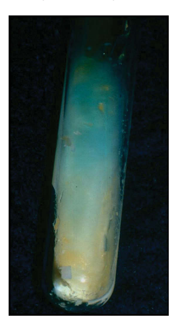
Figure 3: Loewenstein-Jensen mean, after treatment with N acetylcysteine/NaOH: Mycobacterium avium complex (Runyon's group III: non-chromogenic).