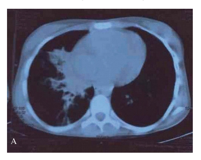
Figure 2: Thoracic computed tomography (CT). (A) Demonstrating tree-in-bud pattern of the right upper lobe and parenchymal consolidation.(B) Showing mediastinal and right hilar lymphadenopathy.

activate a clone of B lymphocytes, which might produce anti-platelet autoantibodies.<sup>3</sup> The patient was treated with high-dose intravenous immunoglobulin (IVIg) (20 g/day, 5 days) and corticosteroid along with anti-TB drugs. Despite discontinuing IVIg and corticosteroid during the treatment, platelet count remained normal; this strongly suggests the causative role of MTb in inducing ITP. Follow-up period showed recurrence of neither thrombocytopenia nor TB. In conclusion, it is important to consider TB in the differential diagnosis of ITP, particularly in high TB-burden areas.