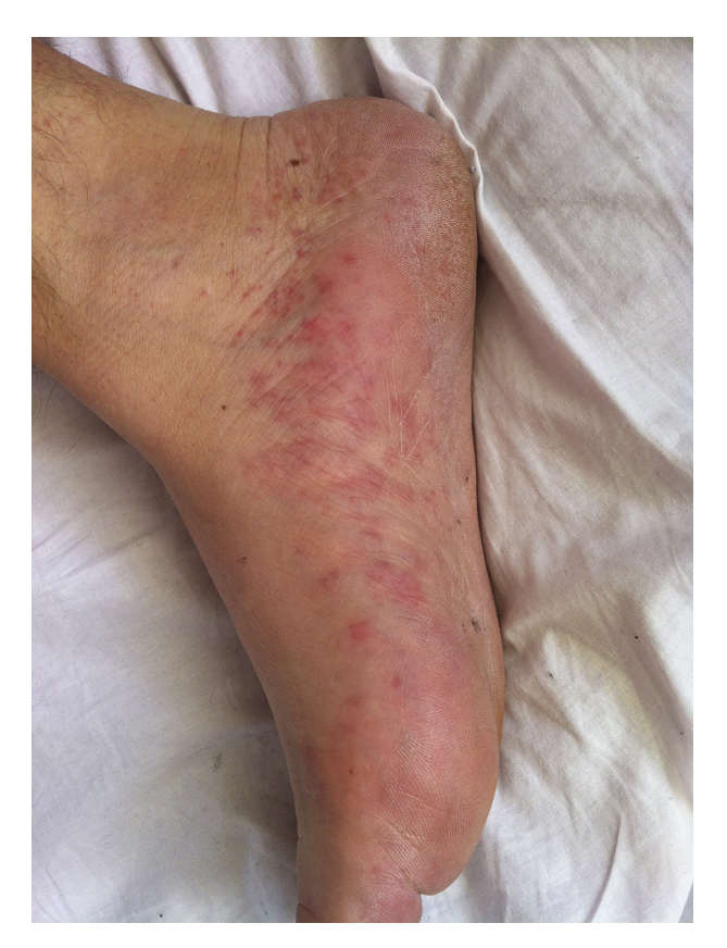
Fig. 2 - Macular rashes on feet.