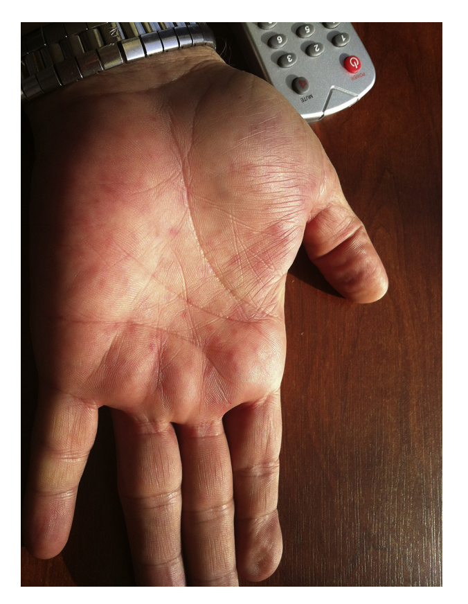
Fig. 1 - Macular rashes on hands.

The authors declare no conflicts of interest.