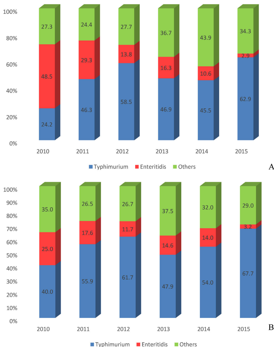
Fig. 2 – Epidemiology of human salmonellosis in southern Brazil, 2010 to 2015. (A) Salmonella isolates from all samples. (B) Salmonella isolates from hospitalized patients. The isolates were classified into three serotypes groups: Typhimurium, Enteritidis and others.

A more detailed analysis was carried out regarding Salmonella serotypes. The overall results demonstrated the