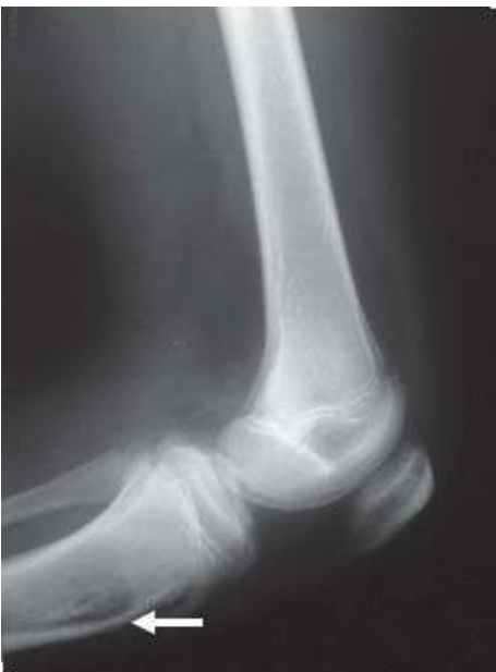
Figure 3: Radiography showing bone reabsorption in the proximal tibia.