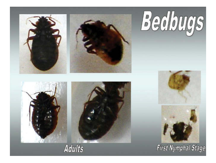
Figure 1: Adult and nymphal stages of the bedbug. Left: adult bedbugs are oval shaped, flat, and approximately 5 mm long, whereas immature ones are much smaller and may be light yellow (right). Bedbugs have a pyramid-shaped head with prominent compound eyes, slender antennae, and a long proboscis tucked underneath the head and thorax.

weeks after they feed on infectious blood, but no transmission of hepatitis B infection was found in a chimpanzee model. Transmission of hepatitis C is unlikely, since hepatitis C viral RNA is not detectable in bedbugs after an infectious blood meal. Live HIV can be recovered from bedbugs up to one hour after they feed on infected blood, but no epidemiologic evidence for HIV transmission by this route exists. 25-27