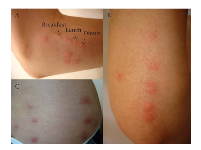
Figure 2: A. Patient presents with multiple pruritic erythema-tous papules on her forearm. Bedbug bites on the arm. Bites typically occur in clusters or in a linear distribution referred to as the "breakfast, lunch, and dinner" sign. B. Detail of the erythematous macules and papules in linear distribution. C. Male patient with vesicle-papules lesions and purpuric papules in linear distribution in lumbar area and abdomen.

urticaria from bedbug bites is not unusual. However, the description of the "urticaria" in one study suggests erythema multiforme. In another study, a man staying in a hotel awakened during the night with severe itching and urticaria on his arm and neck; bedbugs were found in the room. He developed angioedema and hypotension, was hospitalized, and his electrocardiogram showed transient anterolateral ischemia. Eight months later, after an experimental bedbug bite, he developed a wheal at the bite site with generalized itching that required epinephrine administration to resolve his symptoms. A home evaluation of another man who had asthma revealed bedbugs in his bedding and an intradermal allergy skin test with an extract of bedbugs was positive. When his bedding was changed, the asthma symptoms ceased.