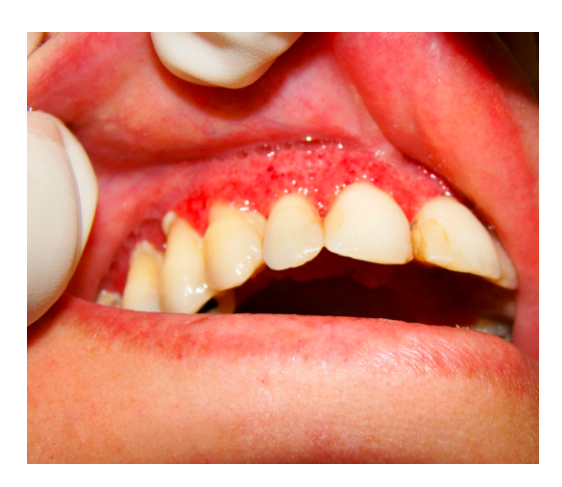
Fig. 2 – Presence of multiple painful moriform ulcers in the upper gum, palate, and upper lip.