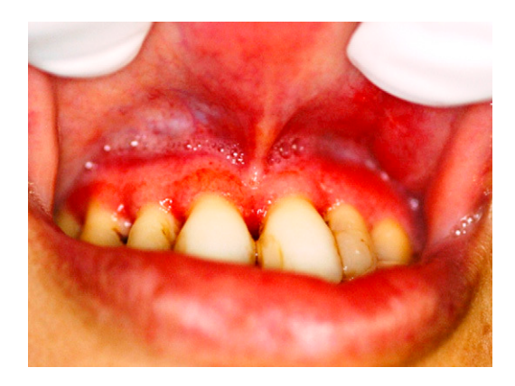
Fig. 4 – One month of antifungal therapy leading to reduction of clinical lesions.

infection. ^{3,4} Herein, the patient was in the sixth month of pregnancy and showed no immunological changes. These facts make the diagnosis of the systemic fungal infection unexpected.