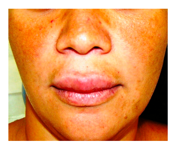
Fig. 1 – The lesion in upper lip was granulomatous cheilitis-like.