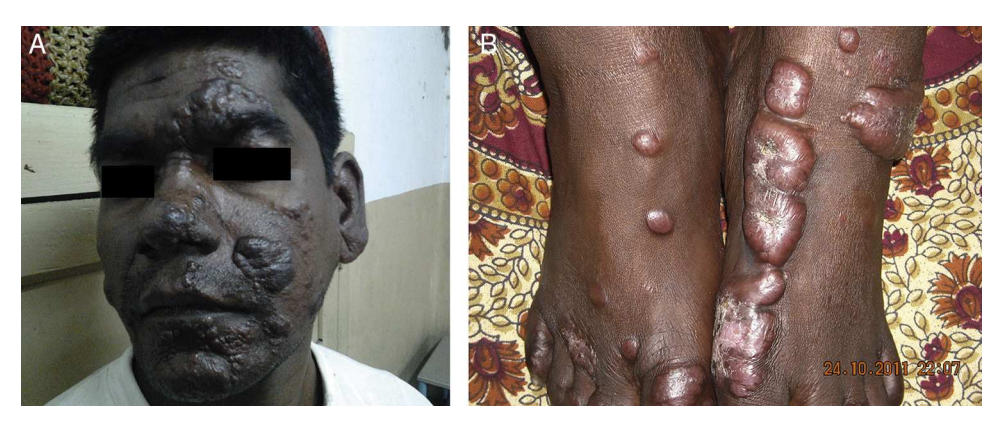
Fig. 2 - Before treatment (A. face and B. both feet).