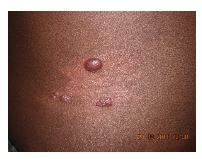
Fig. 1 - Macules with nodules before treatment.

Case proper: A 30-year-old tribal farmer from a remote village of Bihar; a state in eastern India, known to be endemic for leishmaniasis, presented with multiple painless, nonpruritic, progressively increasing hypopigmented macular, papular (Fig. 1), plaque-type, nodular and nodules with central scar over different areas of his body including face, back, upper and lower extremities (Fig. 2A, B) for last one and half years. He first attended a nearby government hospital and was treated there as a case of lepromatous leprosy with multi-drug therapy for one year without any improvement. He presented to us with his progressing skin lesions. On enquiry, he gave a history of prolonged fever with abdominal swelling ten years