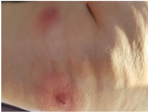
Fig. 1 – Boil-like lesions with serosanguinous secretion.

Two days later, on September 13, she noticed a pale, non-tender nodule on her lower vermilion border on the right side